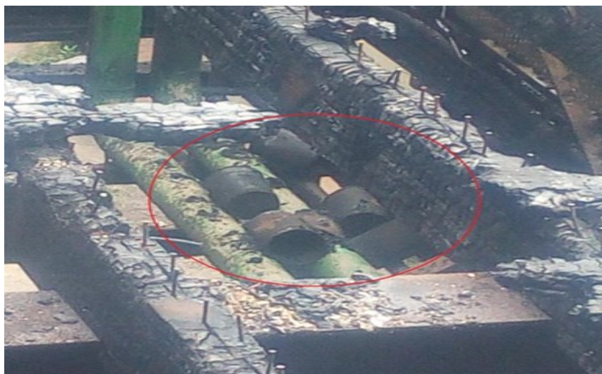
Cans believed to have contained flammable materials

were the acting SHE Manager, the Engineering Manager & the Assistant Production Manager.