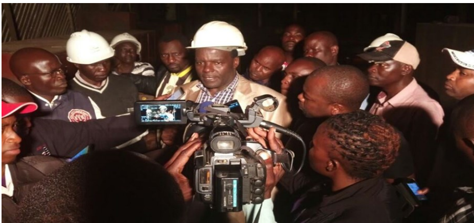
The CEO addressing journalists